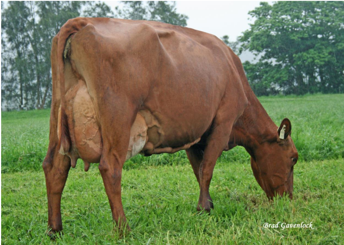
Vest Delta daughter at Ron & Brenda Grahams (photo supplied) , 3 rd 4 year old