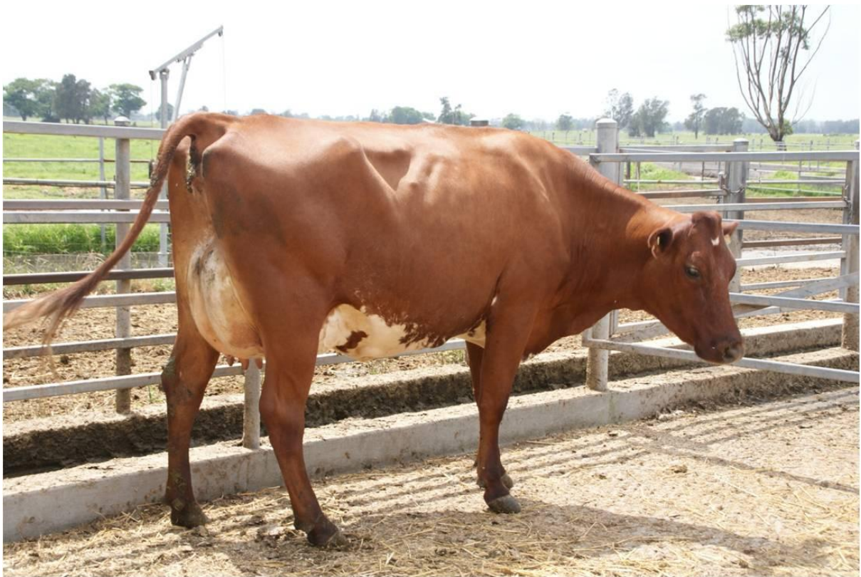
Fyn Aks daughter at Tom & Kyleigh Cochrane, 3 rd 3 year old