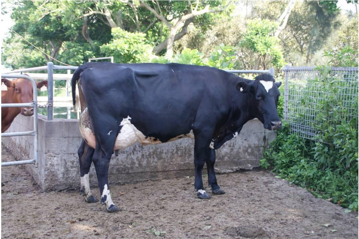
Vest Delta daughter (Cross bred) at Ron & Brenda Grahams, 2 nd 3 year old