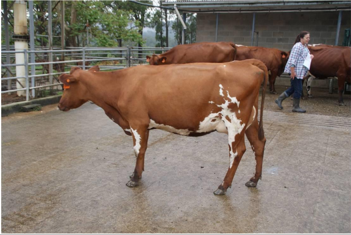
ARBRALPH daughter at Maureen & Neville Wards, 10 th 2 year old